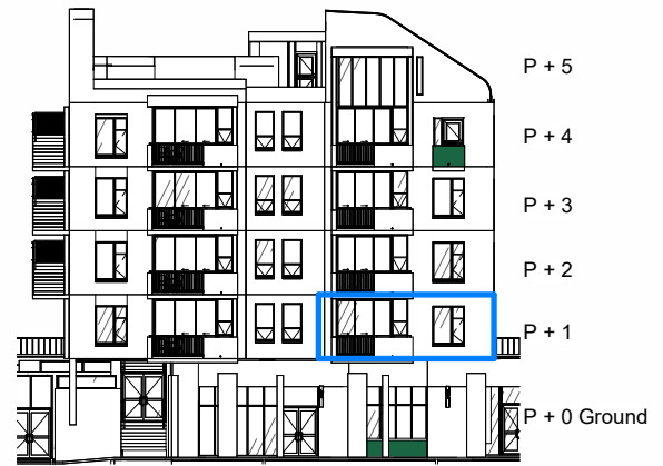
BUILDING A - KEY NORTH ELEVATION