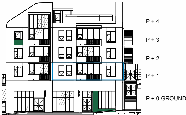
BUILDING D - KEY NORTH ELEVATION

*Disclaimer: Furniture not included. This floor plan is indicative and minor variations may occur. Blue line indicates SAPOA. Red line indicates Sectional Title. Garden (E.U.A) is noted as an EXCLUSIVE USE AREA with possible sloped mounds and vegetation