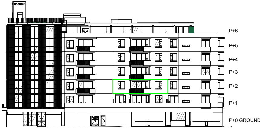
BUILDING J2 - KEY WEST ELEVATION

"Disclaimer: Furniture not included. This floor plan is indicative and minor variations may occur". Blue line indicates SAPOA. Red line indicates Sectional Title. Garden (E.U.A) is noted as an EXCLUSIVE USE AREA with possible sloped mounds and vegetation