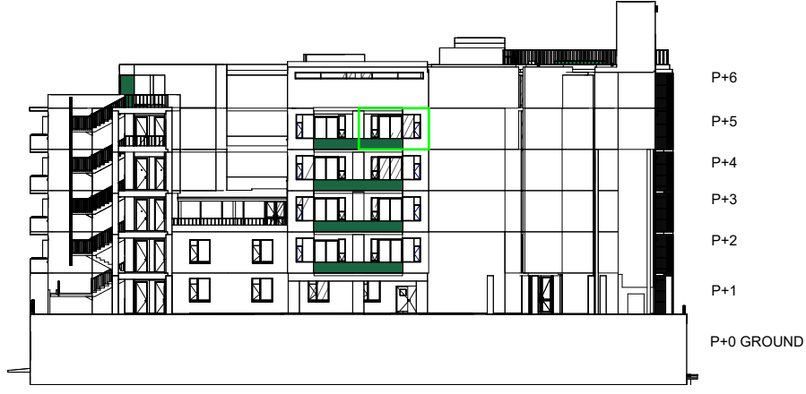
BUILDING J2 - KEY EAST ELEVATION

J508 SECTIONAL TITLE AREA: 53.04m² UNIT TYPE: 12A